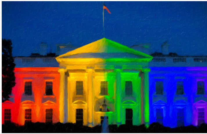
Rainbow-colored lights shone on the White House after the U.S. Supreme Court ruling in favor of same-sex marriage on June 26, 2015.

Rev. Moon said the Last Days will be a time when chaos and confusion will reign: